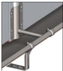
Foot bracket and support leg for double trough, weaners and finishers