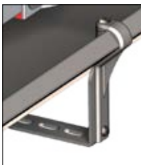
Foot bracket for single trough, weaners and finishers