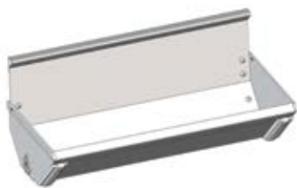
◀ Loose gables