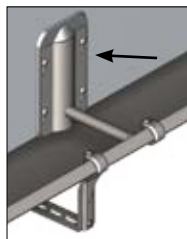
Adapter for support leg 35 mm PVC plate