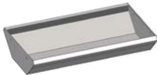
◀ Welded gables