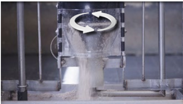
Feed automatically fills when sensor indicates empty trough, according to the adjustable time frame.

Our Baby trough is long, and it makes it easy to build it between the partitions in a pen. The trough dimensions, front height and width are adjusted to the smallest pigs.