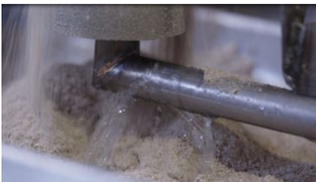
Water and feed are mixed in the bottom of the trough.